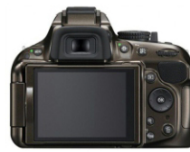
Nikon D 5200 with 24.1 mega pixel

The 7 inch LCD monitor provides one more option for observing.