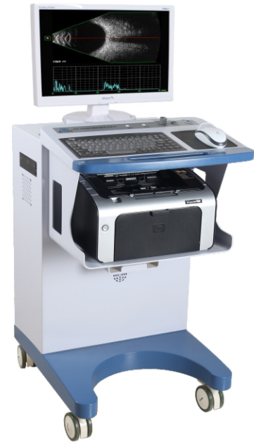
CAS-2000BER (Model B)